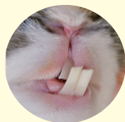
Misaligned and overgrown incisor (front) teeth

If you would like further information on caring for your rabbit, feeding, dental health and vaccination, please don't hesitate to contact our helpful team.