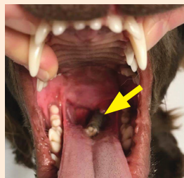
This is a typical stick injury where the stick has become lodged in the dog's throat – see yellow arrow.

Finally – we hope you enjoy the spring with your pets. Signs of poisoning can often be quite vague so please contact us at once if you are at all worried.